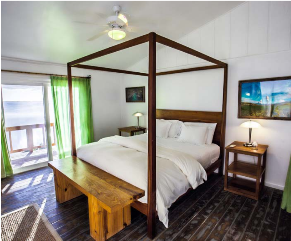
The lodge consists of 7 double rooms 2 king/queen beds.