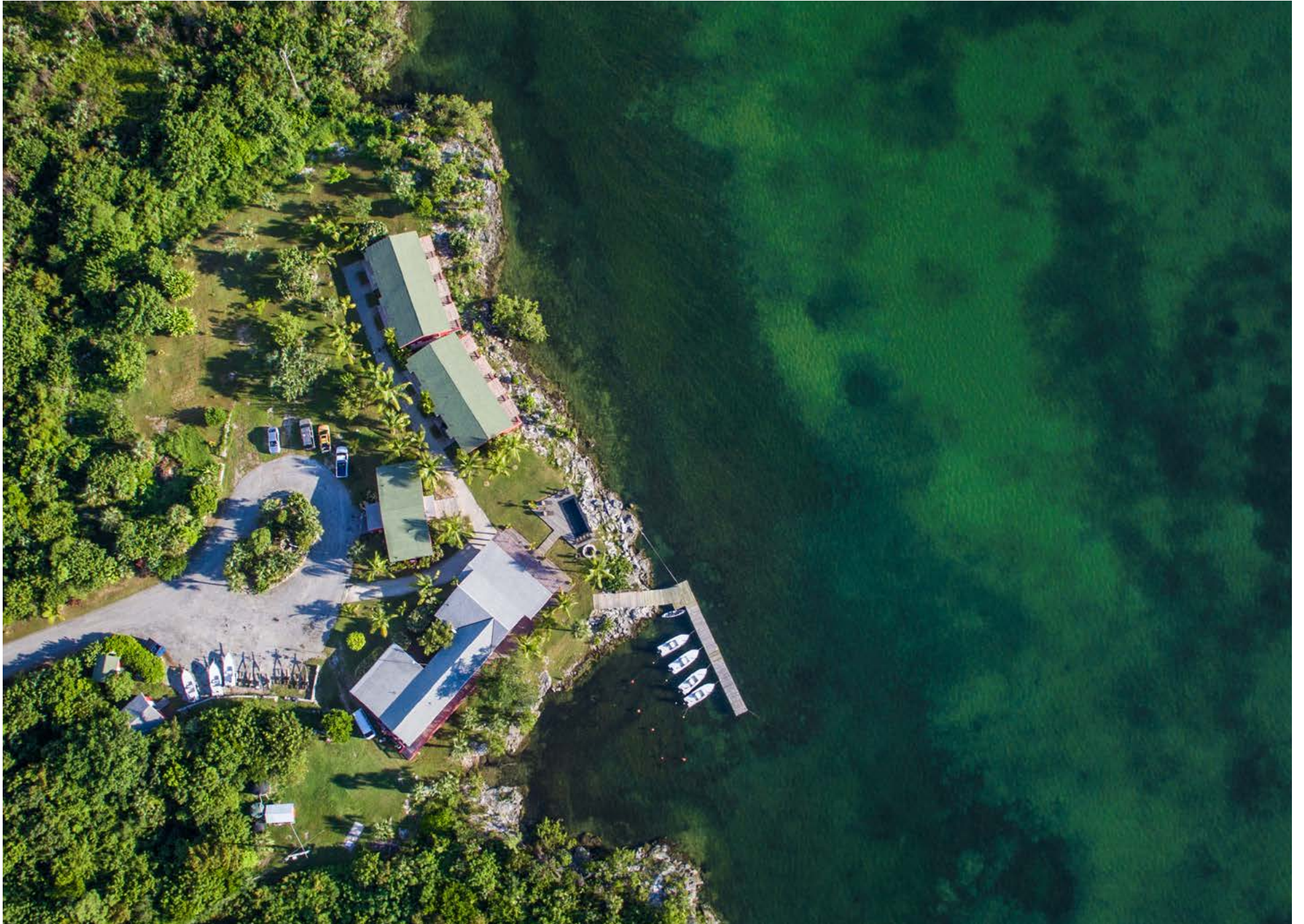
The bright, charming lodge welcomes guests with spectacular waterfront views.