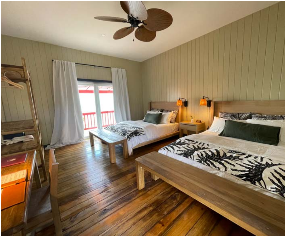
The lodge consists of 7 double rooms 2 queen beds.