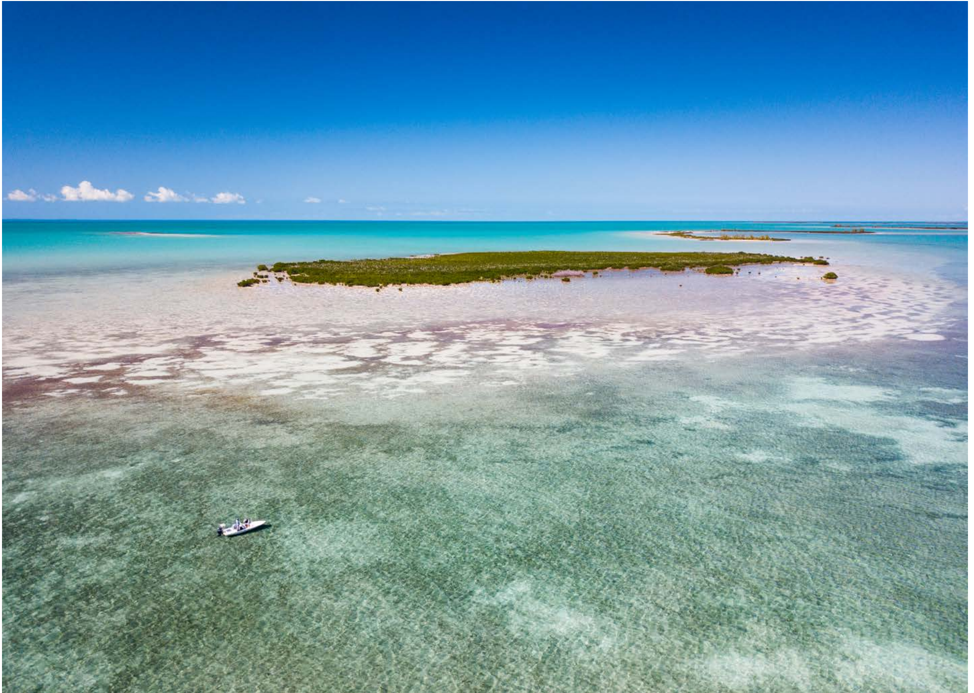
Abaco Lodge is the only fly-fishing operation with direct access to the vast Marls of Abaco