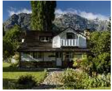
Rainbow & Brown Trout Patagonia Chile