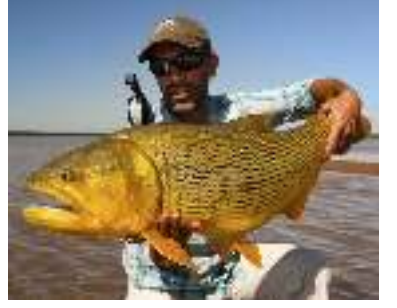
Dorado, Pacú & Pirá Pitá Ituzaingó, Argentina