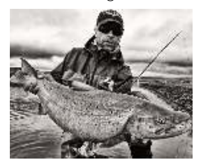
Sea-Run Brown Trout Río Grande, Argentina