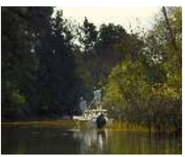
Dorado & Tararira Buenos Aires, Argentina