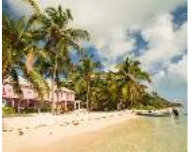
Bonefish South Andros Bahamas