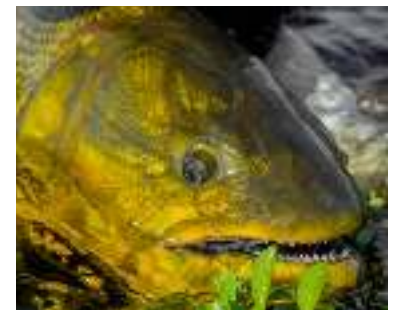
Dorado Iberá Marshlands, Argentina