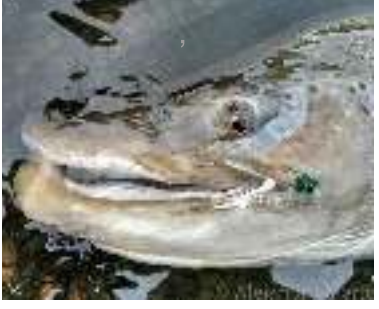
Sea-Run Brown Trout Río Grande Argentina