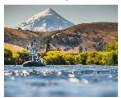
Rainbow & Brown Trout Patagonia, Argentina