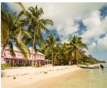
Bair's Lodge Bonefish South Andros, Bahamas