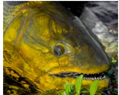
Pirá Lodge Dorado Iberá Marshlands, Argentina