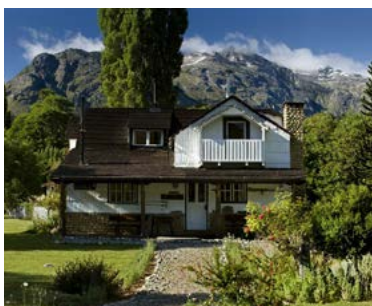
Futa Lodge Rainbow & Brown Trout Patagonia, Chile