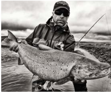
Kau Tapen Lodge Sea-Run Brown Trout Río Grande, Argentina