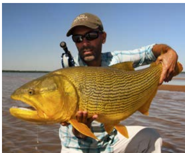
Alto Paraná Lodge Dorado, Pacú & Pirá Pitá Ituzaingó, Argentina