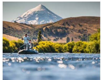
Chime Lodge Rainbow & Brown Trout Patagonia, Argentina