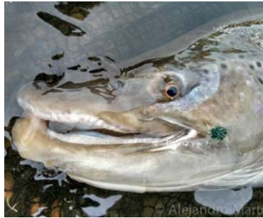
Villa María Lodge Sea-Run Brown Trout Río Grande, Argentina